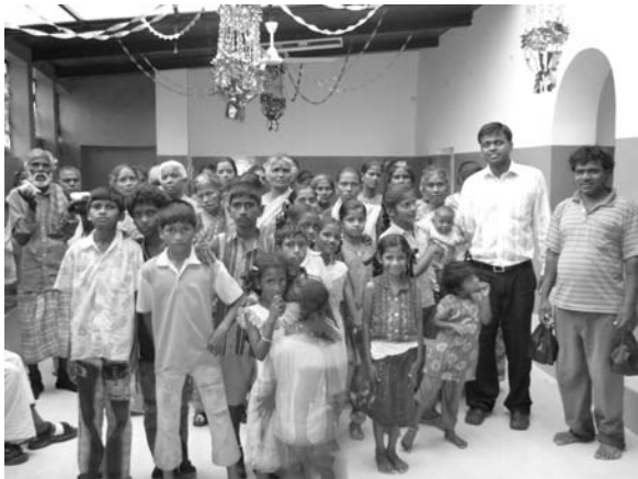
The meeting hall in Bangalore where the lepers and their families meet, has been renovated