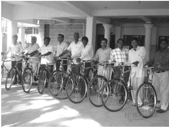
New bikes for IPA pastors