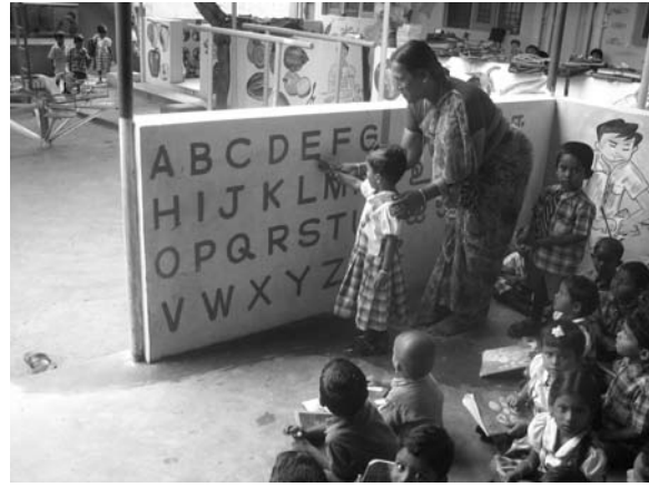
The campus walls in Periyampatti have been beautifully decorated for education purposes