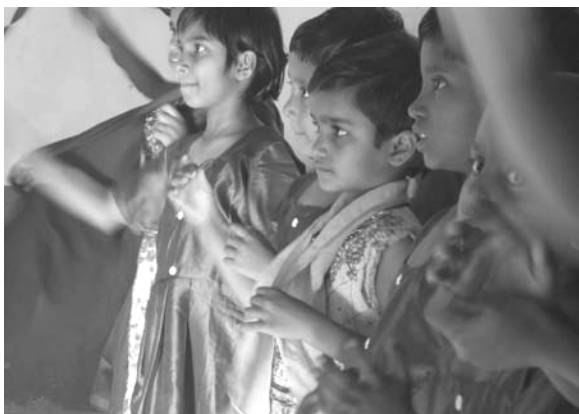
Children at a meeting

The children in the orphanage and the school will present a programme full of song, dance and plays in all villages. The idea is to hold a large youth meeting as the final piece.