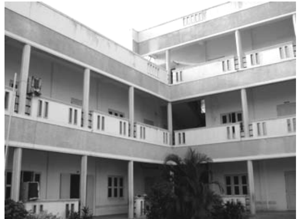
Good News Primary School in Periyampatti

The security of the school and the orphanage continues to be a tremendous concern. It's an urgent advice, also from the side of the government, to guard the premises well. Unfortunately we do not have the means at the moment to hire guards against a suiting salary.