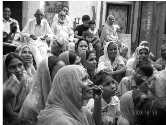
The meetings in Nepal are continuously drawing crowds