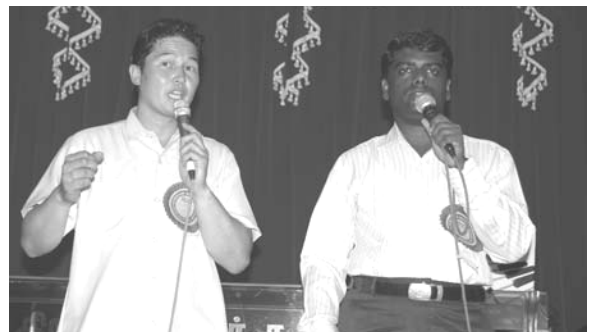
Power Youth Camp

In Palayamkottai the yearly Power Youth Camp took place in August with 1500 participants. Among others this conference is meant to help young people in their choice for Christ. It appeared that the theme "the whole armour of God" was the right message. Sometimes it is difficult for young people to hold on to faith.